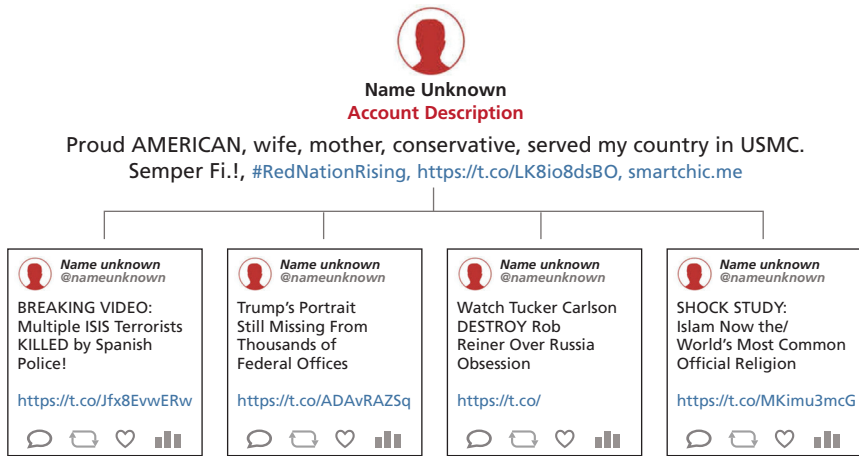
Figure 3.2 Sample IRA Military Account